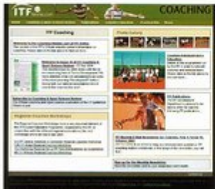
The homepage of the ITF Coaching website.

We hope you enjoy the 53rd issue of ITF Coaching Sport & Science Review.