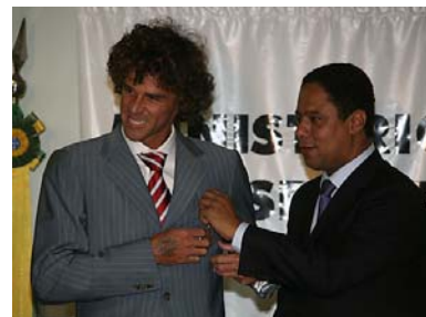
Gustavo Kuerten (BRA) and Orlando Silva Jr.

Kuerten said: "It's quite amazing to receive a medal from the Brazilian people. This tribute represents the energy of our people and I'd like to share this prize with lots of people. I took for granted Brazilian potential. That's why I will work hard to increase tennis in Brazil."