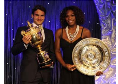
Roger Federer (SUI) and Serena Williams (USA)

Other tennis players to be recognised are Juan Martin del Potro (Breakthrough of the Year), Kim Clijsters (Comeback of the Year) and Men's Wheelchair World Champion Shingo Kunieda (Sportsperson of the Year with a Disability). For further information, visit www.laureus.com .