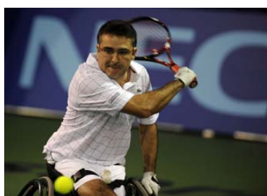
Stephane Houdet (FRA)

Rotterdam has become the second ATP World Tour event this year to stage a wheelchair tennis tournament. Frenchman Stephane Houdet went on to win both the singles and doubles titles at the 2nd World Wheelchair Tennis Tournament, an ITF 1 Series event on the NEC Wheelchair Tennis Tour.