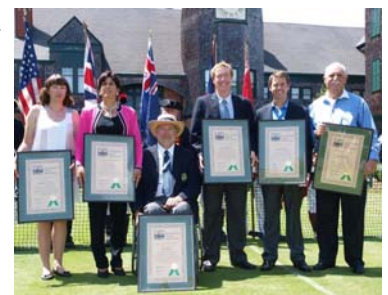
2010 Hall of Fame inductees

For more information visit www.itftennis.com .