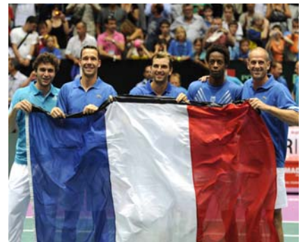
French Davis Cup team

The semifinals will be played alongside the World Group play-offs on 17-19 September, with venues to be confirmed by 21 July.