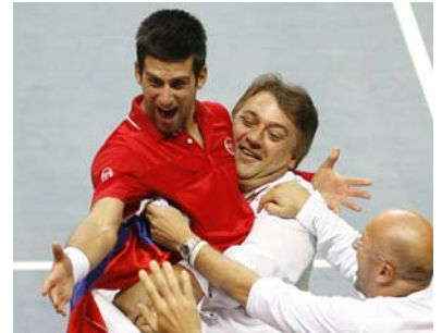
Serbia's Novak Djokovic