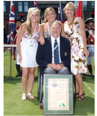
Brad Parks and family

After being injured in a skiing accident, Parks began experimenting with hitting tennis balls from a wheelchair while he was in rehabilitation and in 1976 wheelchair tennis was born. He founded the National Foundation of Wheelchair Tennis (NFWT) as the sport's organising body in USA and as more athletes became involved, the Wheelchair Tennis Players Association (WTPA) was formed.