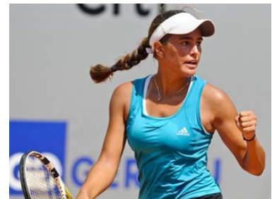
Monica Puig (PUR)