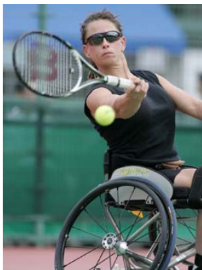
Daniela di Toro (AUS)

Japan's Shingo Kunieda, Daniela di Toro of Australia and American David Wagner won the singles titles at last week's Japan Wheelchair Open in Iizuka, the second Super Series event of the 2010 NEC Wheelchair Tennis Tour.