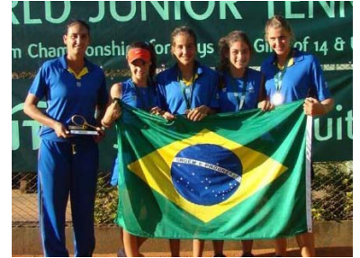
Brazil's World Junior Tennis girls' team

The South America qualifying event for the World Junior Tennis competition also took place last week in Bauru, Brazil. Ten boys' and girls' teams both competed for three places at the Finals in Prostějov. Brazil won the girls' event and will be joined in the Finals by runner-up Paraguay and third placed Colombia. Chile won the boys' event to qualify for the Finals and will be joined by runner-up Argentina and third placed Venezuela.