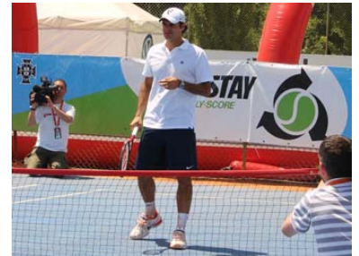
Roger Federer (SUI)