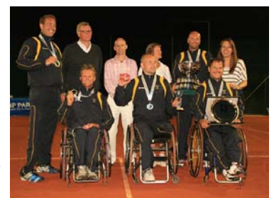
Men's champions Sweden

In the women's event, defending champion Netherlands secured an astonishing 23rd title without dropping a rubber. Their final opponents Japan had upset Great Britain 2-1 in the semifinals, with 16-year-old Yui Kamiji the star of the team. In the final Kamiji came within two points of taking the first set against world No. 7 Jiske Griffioen in the opening rubber, but Griffioen held on for a 75 61 victory. Aniek van Koot, who was leading the Dutch team for the first time, then wrapped up Netherlands's triumph with a 61 62 win over Yui Kamiji.