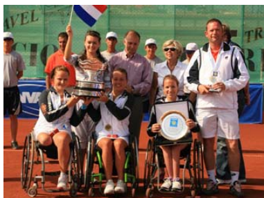
Women's champions Netherlands