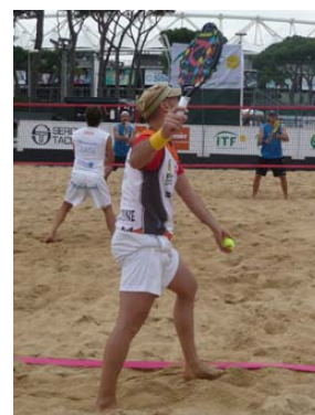
Men's final action